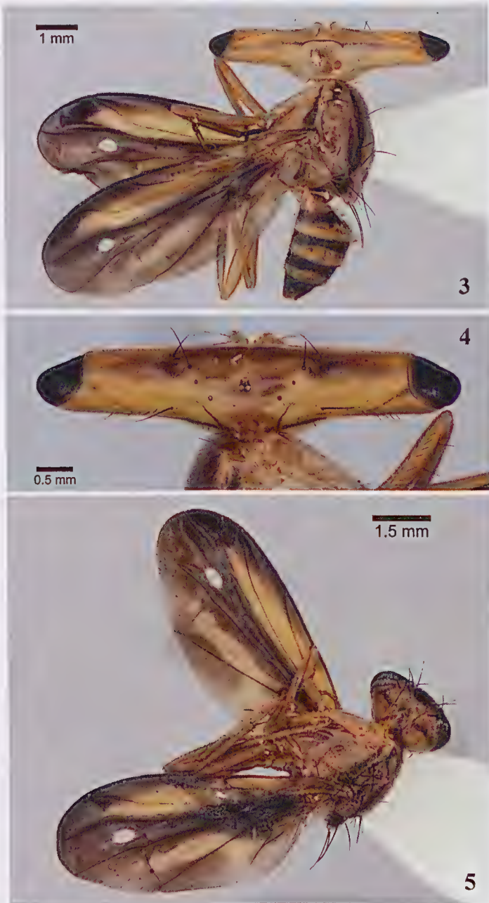
Figs 3-5. Themara andamanensis sp. n.: (3) holotype male, habitus; (4) male head, dorsal view; (5) paratype female, habitus.